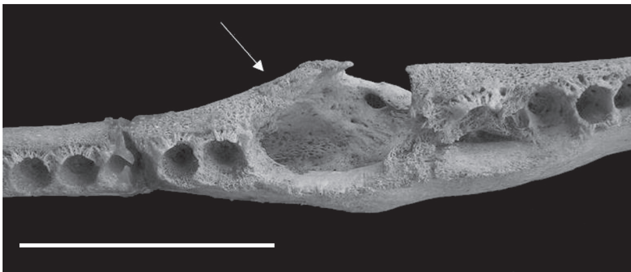
Fig 1. Occlusal view of the left dentary of Sotalia fluviatilis (Gervais, 1853) (INPA MA 056) modified by osteomyelitis. The medial region of the dentary shows the formation of a fistula and deformation of the alveoli. Pathology indicated by the arrow. Scale bar, 3 cm.